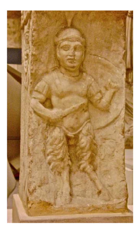
Figure 2. Marble altar: Pan, a rustic deity with goat legs, shown in armor. Roman, 1<sup>st</sup> CE–2<sup>nd</sup> CE (probably).

Pan has as many battle myths as he does myths in which he is chasing after nymphs. These are less well remembered. He fought with Hermes to help Zeus gain power over the Titans (Kerenyi, 1996), was a general in Dionysus's army in India (Polyaenus, 1994), came to the rescue of Athens at the Battle of Marathon (Pausanias, 1961), and aided the Athenians in routing a Gallic army (Herodotus, 1921/1960). Pan's method was to infect the enemy with fear. For example, Polyaenus (1994) (born c. 100 CE in Bithynia), a rhetorician and author of Stratagems of War , recounted the myth of Pan's chaotic use of echoes while a general in service to Dionysus in India: