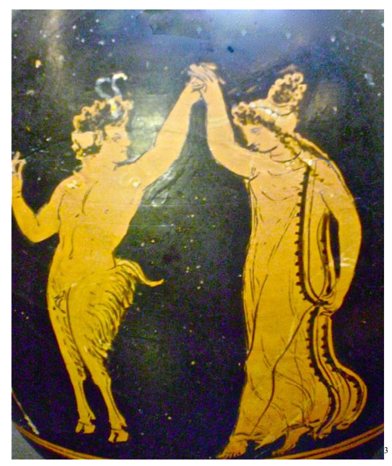
Figure 4. Aegipan dancing with Echo. Red figure olpe attributed to The Underworld Painter. 330-310 BCE. British Museum: London, England.

In one version from antiquity the nymph Syrinx does not remain stuck; forever a reed. She evolves to an even freer state than she was as a naiad of the River Ladon. In Nonnos, a Greek epic poet of the fifth or sixth century, Syrinx lived on as one of the Bakhoi (1940/1062). After the panic she devolved to a vegetative state, but in this telling, Syrinx regained her freedom of speech and movement and then gained sexual freedom as well. She became a nymph in Dionysus' retinue. "Syrinx escaped from Pan's marriage and left him without a bride, and now she cries euoi to the newly-made marriage of Dionysos" (Nonnos, 1940/1962, p. 27 [XVI. 330-334]). In the ancient Bacchic revels, euoi (pronounced you-oh-ee) is a cry of impassioned rapture (Morwood & Taylor, 2002, p. 144).