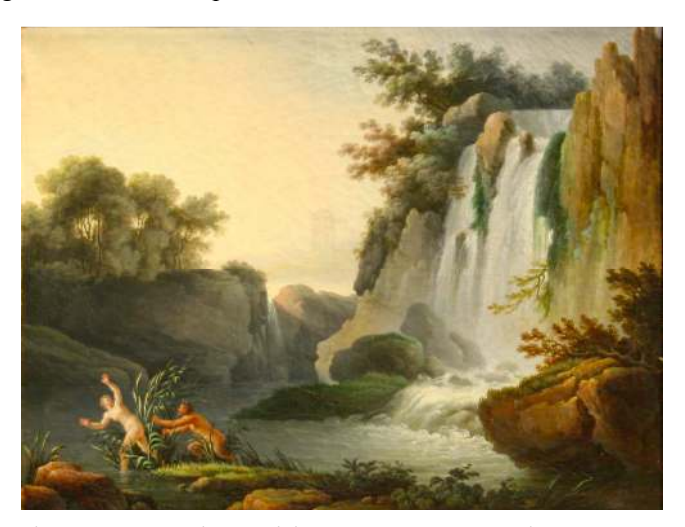
Figure 1. Pan et Syrinx, Lavinia Fontana, 1891, Musee des Beaux-Arts de Marseille. In the public domain.

Cultural complexes are formed out of fear-based oppositions to other social groups (Kimbles, 2003), and then polarize the psychic energy field of the group they fear. The polarization creates a strong potential for an opposing complex to form in the projected-upon group and leads to a rigid dichotomy between the unconscious of the two groups. The metaphor I use to envision this idea is the mechanistic revolving and interlocking of gears. Each gear is a spinning wheel with teeth, or cogs, that all together create a force that moves a corresponding cog in an adjoining wheel. The cogwheels are enmeshed and dependent on each other for motion and speed. Such a mechanistic arrangement moves parts in a rigid lockstep. Once the gears are in motion, minimal effort is needed to keep the process going, and there is no possibility for change. When one group in a culture negatively projects its unconscious fantasies onto another group the projections are then mirrored back and a process, like a cogwheel, is set in motion. Projection dangerously reinforces ethnocentric antagonism between groups and promotes the spread of negative cultural complexes.