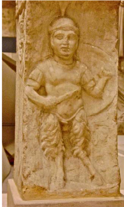
Figure 2. Marble altar: Pan, a rustic deity with goat legs, shown in armor. Roman, 1 st CE–2 nd CE (probably).

Pan has as many battle myths as he does myths in which he is chasing after nymphs. These are less well remembered. He fought with Hermes to help Zeus gain power over the Titans (Kerenyi, 1996), was a general in Dionysus's army in India (Polyaenus, 1994), came to the rescue of Athens at the Battle of Marathon (Pausanias, 1961), and aided the Athenians in routing a Gallic army (Herodotus, 1921/1960). Pan's method was to infect the enemy with fear. For example, Polyaenus (1994) (born c. 100 CE in Bithynia), a rhetorician and author of Stratagems of War , recounted the myth of Pan's chaotic use of echoes while a general in service to Dionysus in India: