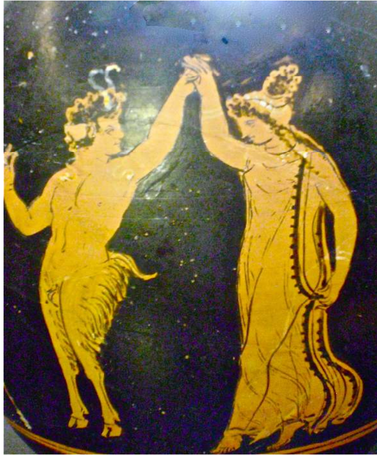
Figure 4. Aegipan dancing with Echo. Red figure olpe attributed to The Underworld Painter. 330-310 BCE. British Museum: London, England.

In one version from antiquity the nymph Syrinx does not remain stuck; forever a reed. She evolves to an even freer state than she was as a naiad of the River Ladon. In Nonnos, a Greek epic poet of the fifth or sixth century, Syrinx lived on as one of the Bakhoi (1940/1062). After the panic she devolved to a vegetative state, but in this telling, Syrinx regained her freedom of speech and movement and then gained sexual freedom as well. She became a nymph in Dionysus' retinue. "Syrinx escaped from Pan's marriage and left him without a bride, and now she cries euoi to the newly-made marriage of Dionysos" (Nonnos, 1940/1962, p. 27 [XVI. 330-334]). In the ancient Bacchic revels, euoi (pronounced you-oh-ee) is a cry of impassioned rapture (Morwood & Taylor, 2002, p. 144).