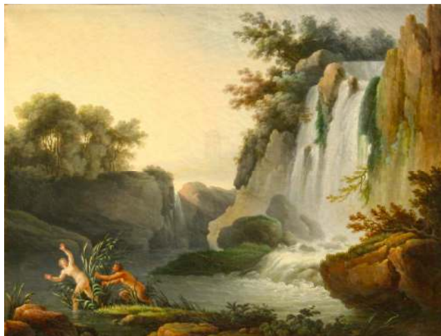
Figure 1. Pan et Syrinx, Lavinia Fontana, 1891, Musee des Beaux-Arts de Marseille. In the public domain.

Cultural complexes are formed out of fear-based oppositions to other social groups (Kimbles, 2003), and then polarize the psychic energy field of the group they fear. The polarization creates a strong potential for an opposing complex to form in the projected-upon group and leads to a rigid dichotomy between the unconscious of the two groups. The metaphor I use to envision this idea is the mechanistic revolving and interlocking of gears. Each gear is a spinning wheel with teeth, or cogs, that all together create a force that moves a corresponding cog in an adjoining wheel. The cogwheels are enmeshed and dependent on each other for motion and speed. Such a mechanistic arrangement moves parts in a rigid lockstep. Once the gears are in motion, minimal effort is needed to keep the process going, and there is no possibility for change. When one group in a culture negatively projects its unconscious fantasies onto another group the projections are then mirrored back and a process, like a cogwheel, is set in motion. Projection dangerously reinforces ethnocentric antagonism between groups and promotes the spread of negative cultural complexes.